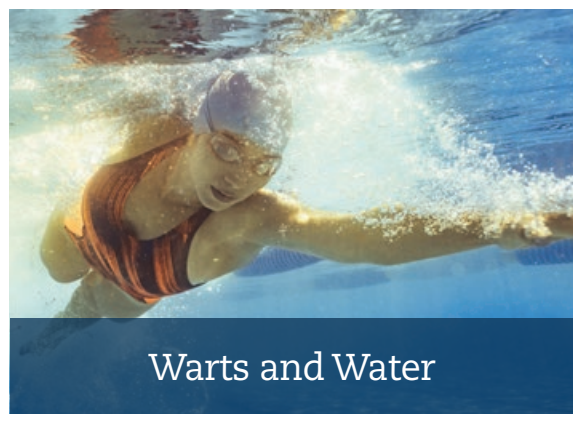
See page one.

No part of this newsletter may be used or reproduced in any manner whatsoever without written permission of the author. No expressed or implied guarantees have been made or are made by the author or publisher. Individual results may vary. Neither author nor publisher accepts any liability or responsibility to any person with respect to any loss or damage alleged to have been caused by the information in this newsletter. Always seek professional medical advice.