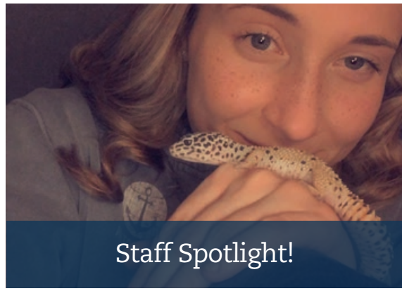
See page one.

No part of this newsletter may be used or reproduced in any manner whatsoever without written permission of the author. No expressed or implied guarantees have been made or are made by the author or publisher. Individual results may vary. Neither author nor publisher accepts any liability or responsibility to any person with respect to any loss or damage alleged to have been caused by the information in this newsletter. Always seek professional medical advice.